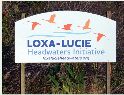
Signage identifying the site of the Loxa-Lucie Headwaters Initiative property.