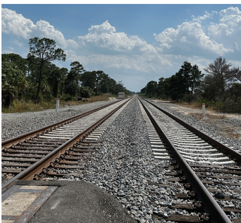
Brightline's new double rail bisects Jonathan Dickinson State Park.

With upgrades of existing rails and on-going construction of additional train tracks, Brightline has begun trial runs of its higher-speed trains through Treasure Coast communities. Improvements are underway on the railroad bridge over the Loxahatchee River. A second set of tracks, however, is not proposed for the railroad bridge over the St. Lucie River, and the Guardians appreciate U.S. Representative Brian Mast's efforts with the U.S. Coast Guard to reduce adverse impacts on navigation