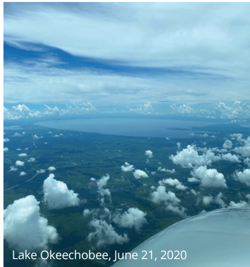
Lake Okeechobee, June 21, 2020