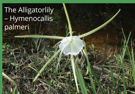
The Alligatorlily – Hymenocallis palmeri

If you guessed the Alligatorlily, you are correct!