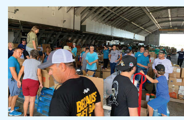
Facebook, Operation 300