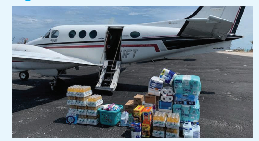
Facebook, Operation 300, Supplies for Hurricane Dorian Victims