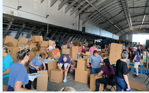
Facebook, Operation 300, Volunteers, Stuart Airport