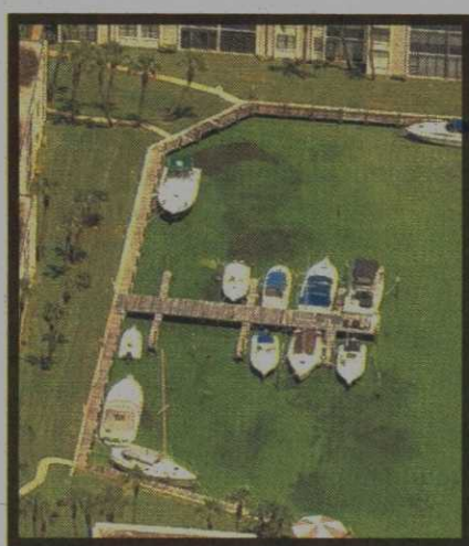
Right: Algae blooms in the St. Lucie River near Stuart in 2005.